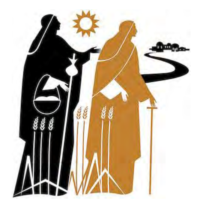
Ames United Church of Christ Sunday, October 18, 2015

Welcome to Ames UCC! Worship is the way we praise God and learn what it means to be a Christian. Services of worship are just that: a way that we serve the power that calls us together and sends us out to be the eyes, hands, and feet of justice in the world. We hope that you leave today feeling connected, renewed, and in relationship with the holy.