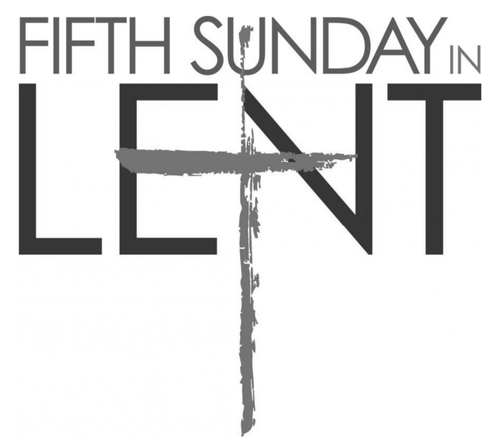
Ames United Church of Christ Sunday, March 26, 2017

Welcome to Ames UCC! Worship is the way we praise God and learn what it means to be a Christian. Services of worship are just that: a way that we serve the power that calls us together and sends us out to be the eyes, hands, and feet of justice in the world. We hope that you leave today feeling connected, renewed, and in relationship with the holy.