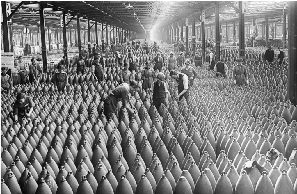
A munitions warehouse in Chilwell, England, in July 1917