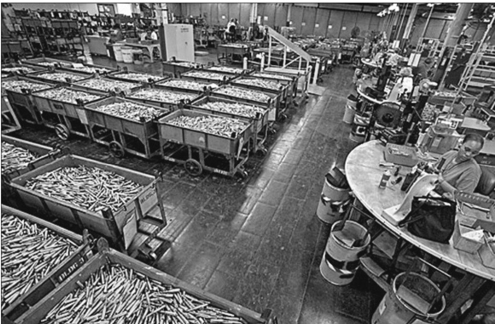
Lake City Army Ammunition Plant in Independence, MO