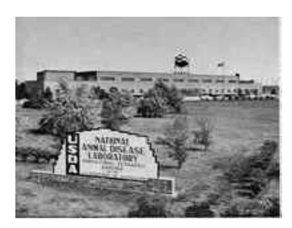
National Animal Disease Laboratory