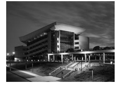
CY Stephens Auditorium